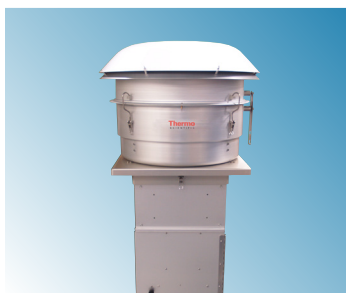
PM-10 or PM-2.5 High Volume Sampler